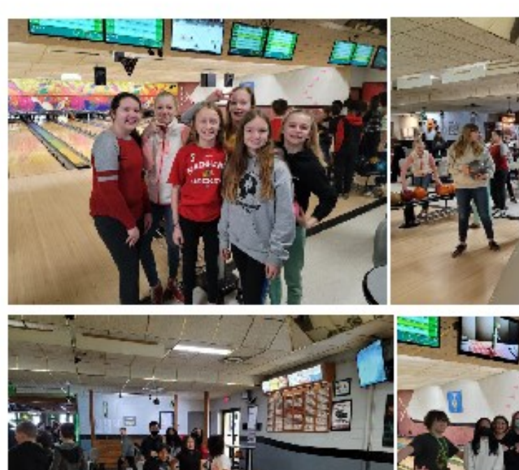
Team 6-2 enjoyed 'Bowling Fun' last Friday morning as part of our February Incentive!